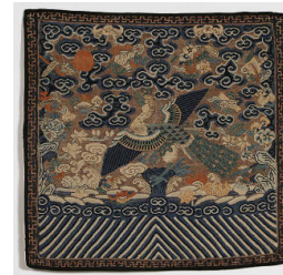
Title: Badge of Rank Date: 1700s Medium: silk, dye and metallic thread