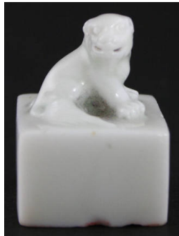
Title: Seal Date: 18th century Primary Maker: Artist Unknown Medium: porcelain and glaze