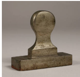
Title: Seal Date: 19th century Medium: bronze