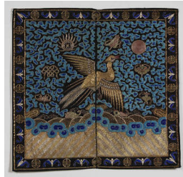
Title: Badge of Rank Date: ca. 1800 Medium: silk, dye and metallic thread