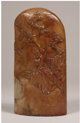
Title: Seal Date: 1830 or 1890 Medium: stone