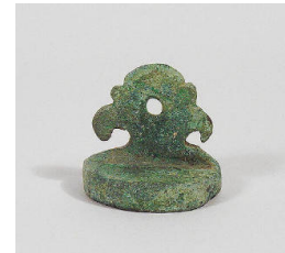
Title: Seal Date: 18th century Primary Maker: Artist Unknown Medium: copper alloy