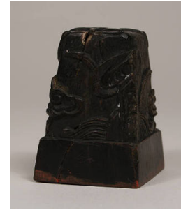
Title: Seal Date: 19th century Medium: bone or wood and stain