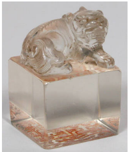
Title: Seal Date: 19th century Primary Maker: Artist Unknown Medium: glass