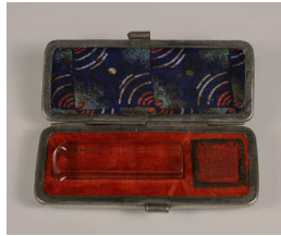
Title: Seal Box with Seal Stone and Paste Date: 19th century Medium: rock crystal, silver, leather, silk and pigment